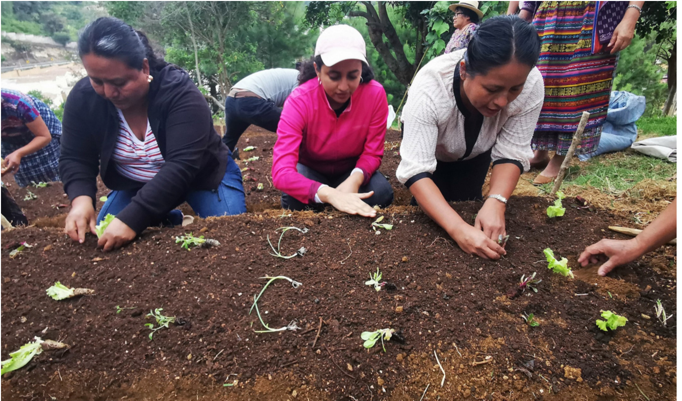
Vegetable cultivation, July 25, 2025, Kaqla Mayan Women's Center, Sacatepéquez

Permaculture represents a sustainable lifestyle through agriculture that is rooted in natural ecosystems, honoring nature, and promoting the health and well-being of all living beings. Consequently, it avoids the use of chemicals or products that could damage the ecosystem or human health. The approach aims to utilize space and local conditions effectively to fulfill human needs while maintaining harmony with nature.