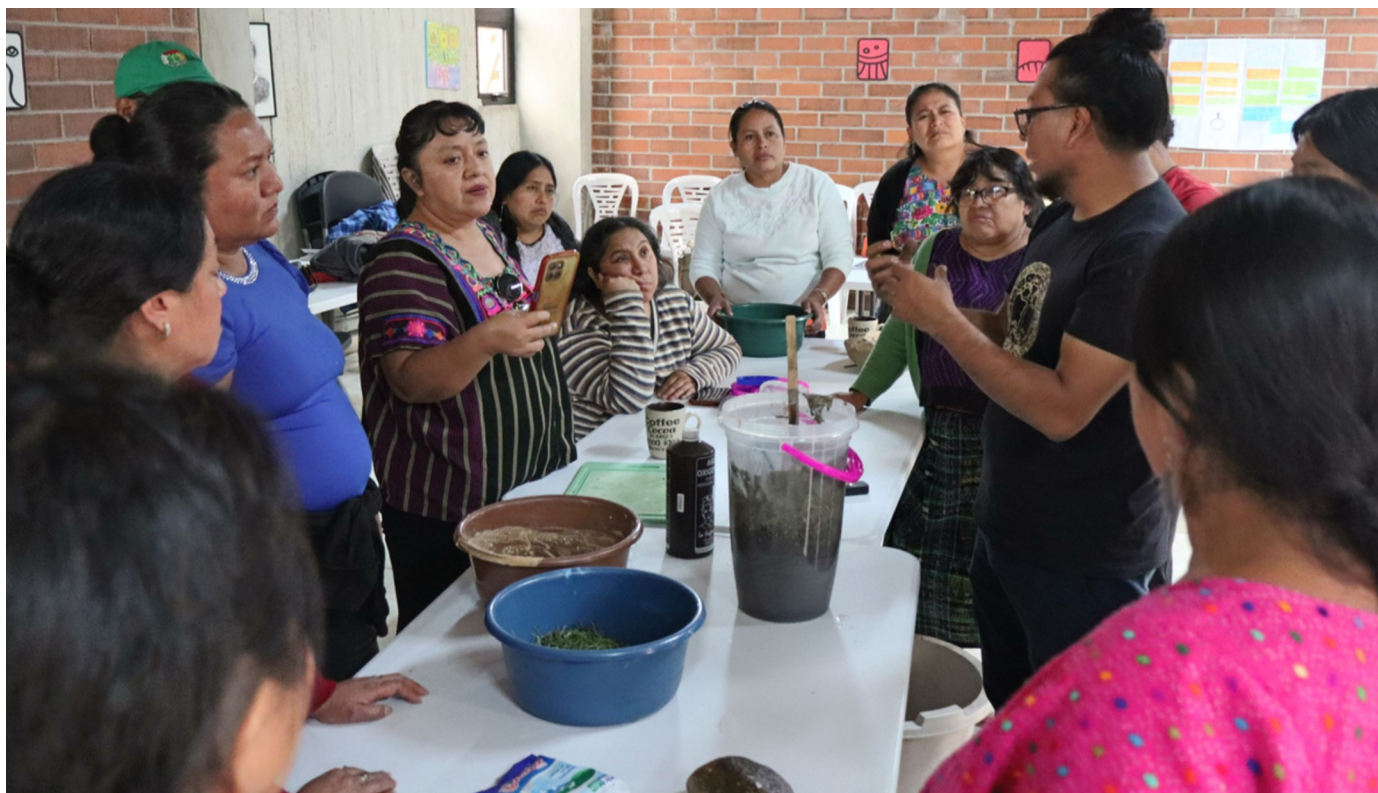
Preparation of bio stimulants, bio repellents, and biocontrol agents, July 26, 2025, Kaqla Mayan Women's Center, Sacatepéquez