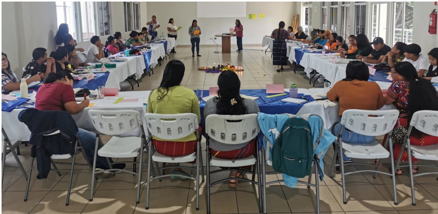
Knowledge Exchange Academy, June 4, 2025, Guatemala City.