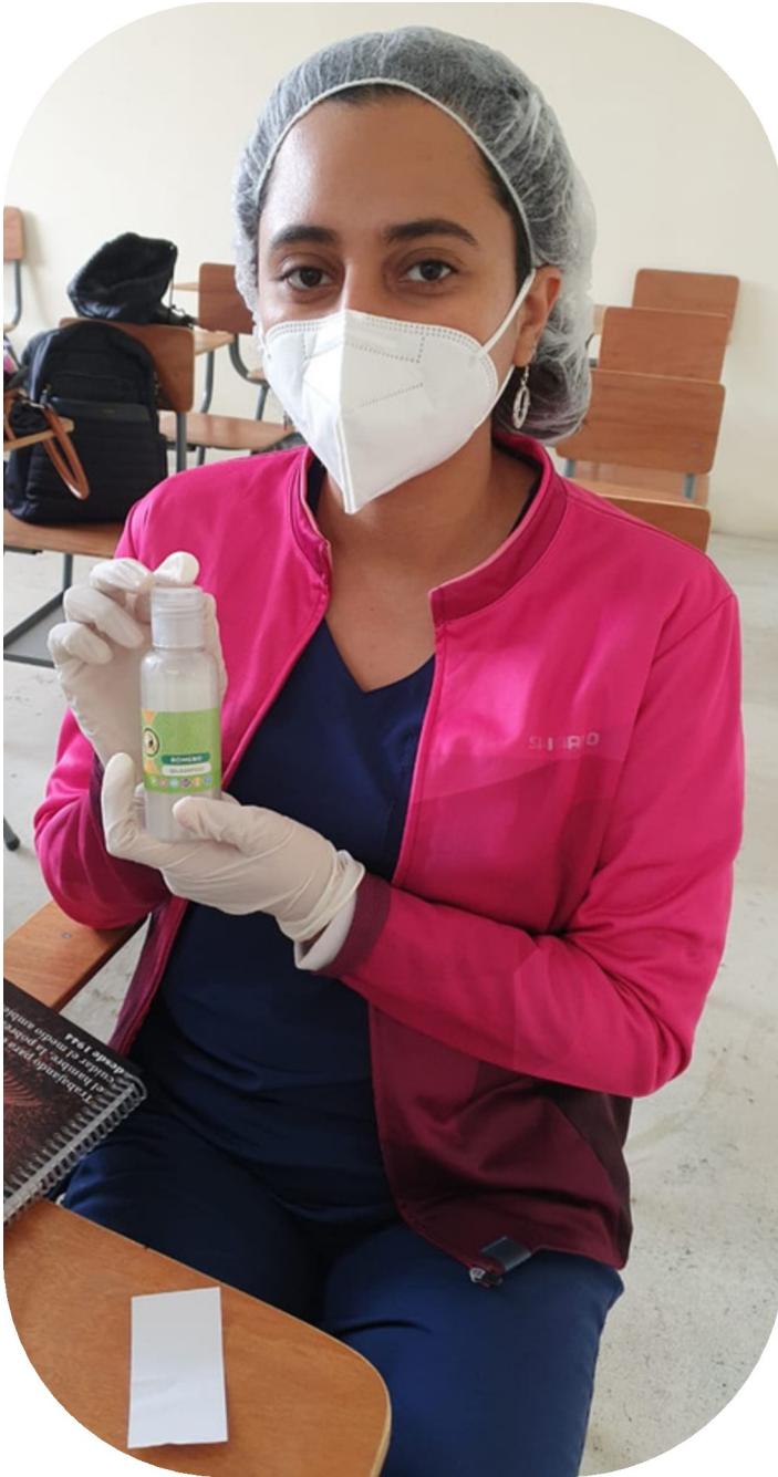
Production of medicinal shampoo, June 27, 2025, Quetzaltenango.

During June and July, I (Flor) participated in a weekly naturopathy course, where I learned about utilizing plants to address minor ailments and prevent illness. In the future, the knowledge I have gained will be integrated into the training project to enhance the well-being and financial stability of women and their families.