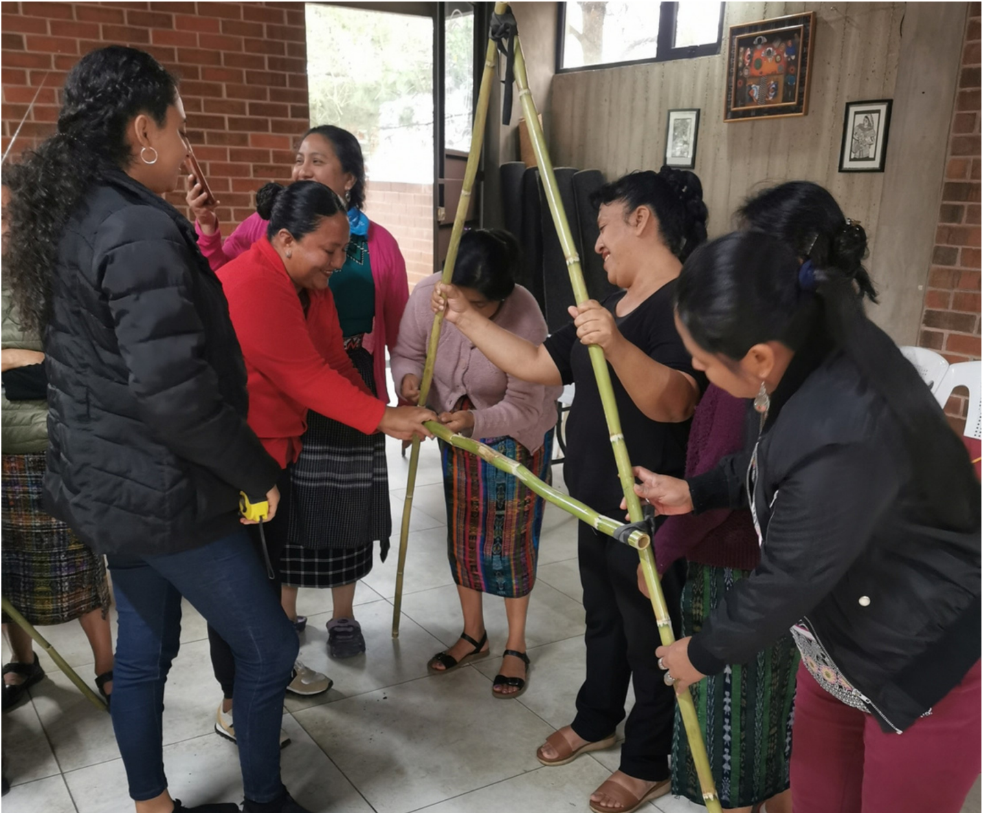
Development of Device A, designed for measuring soil levels, Permaculture Course, June 26, 2025. Kaqla Mayan Women's Center, Sacatepéquez